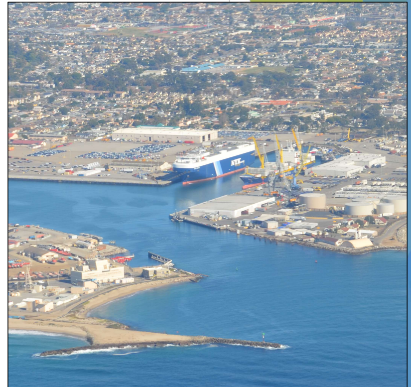
NYK Vessel at Port Hueneme