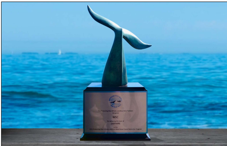
Statue for Previous Sapphire Award