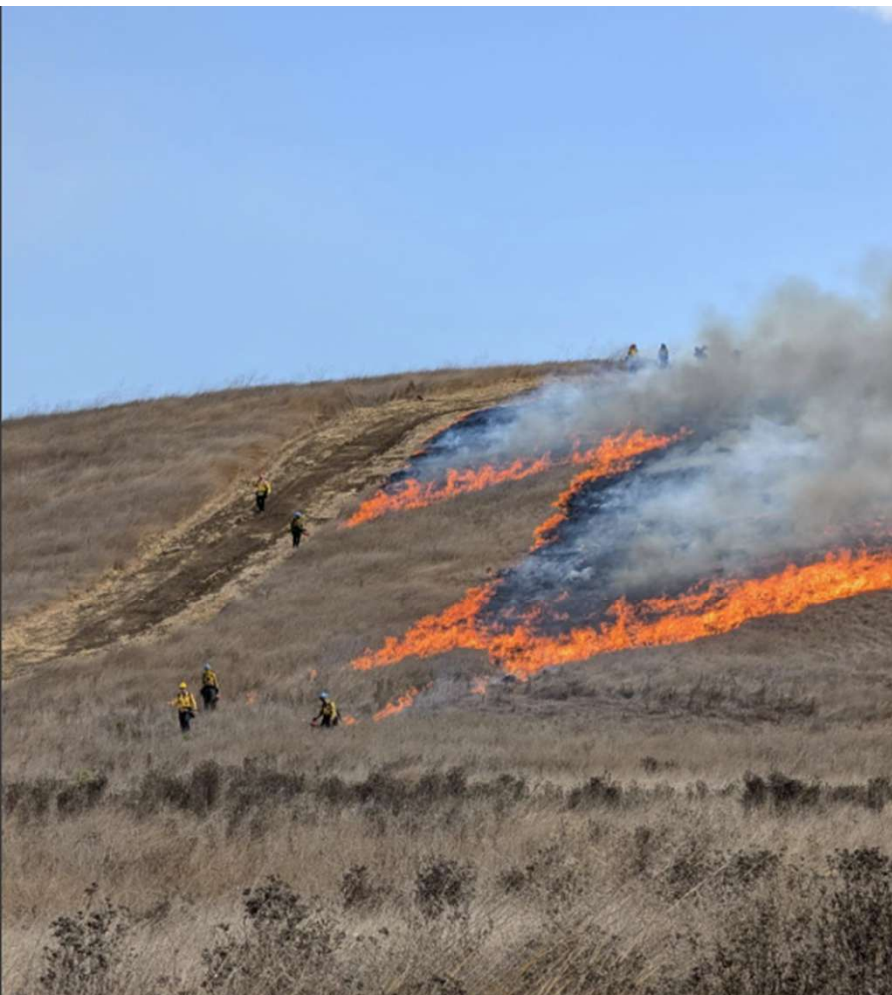
2025 Gilardi Burn – 234 acres