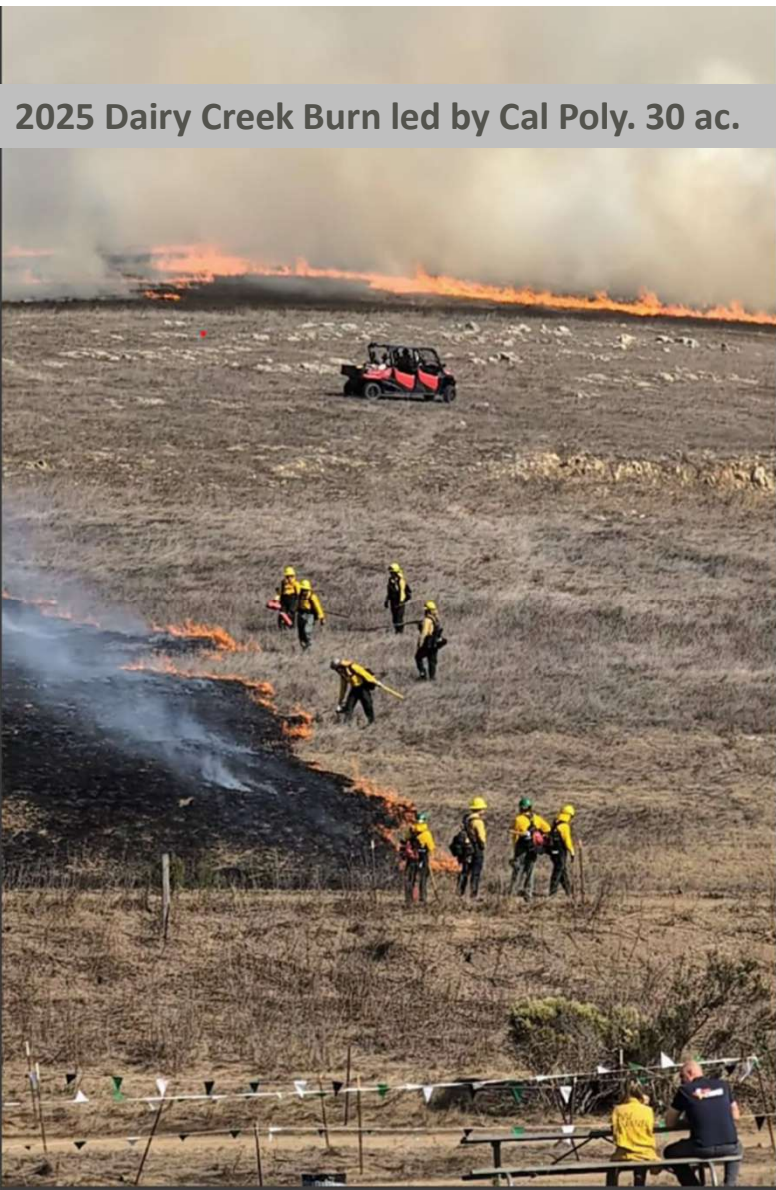
2025 Dairy Creek Burn led by Cal Poly. 30 ac.