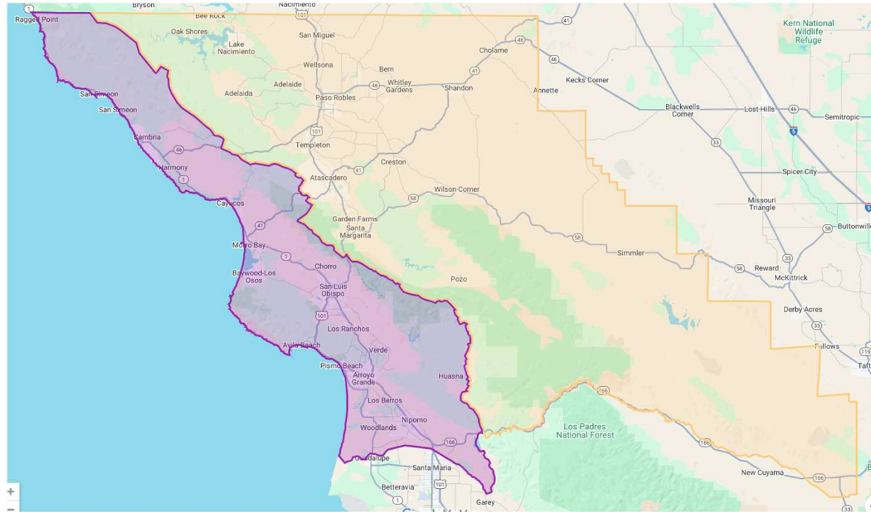
Burn Zones: Coastal and Inland