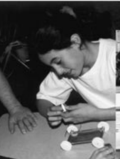
Earthlings of all species celebrated Earth Day in Santa Barbara. (right)